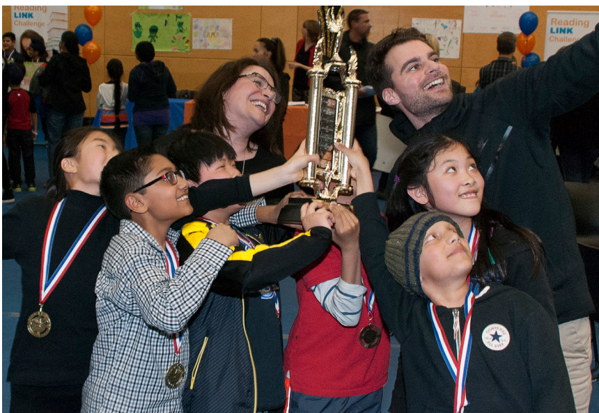
2016-2017 Grand Challenge Winners, The T-Erma-nators from Erma Stephenson Elementary