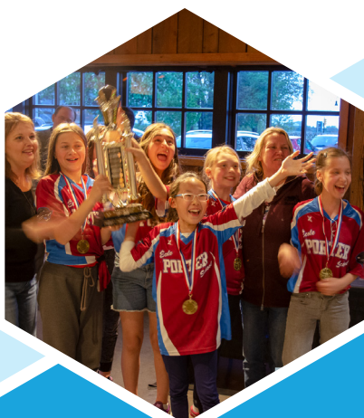
2018-2019 Grand Challenge Winners, Smart Doritos

At the Grand Challenge, winning teams from the Coquitlam, Fraser Valley, New Westminster, North Vancouver City, Port Moody, and Surrey Libraries meet to compete for the regional championship. The winning school is presented with the beautiful RLC Trophy.