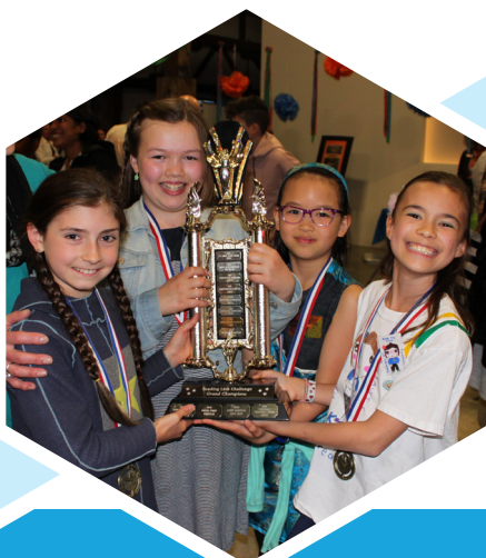
2017–2018 Grand Challenge Winners, Fantastic 4